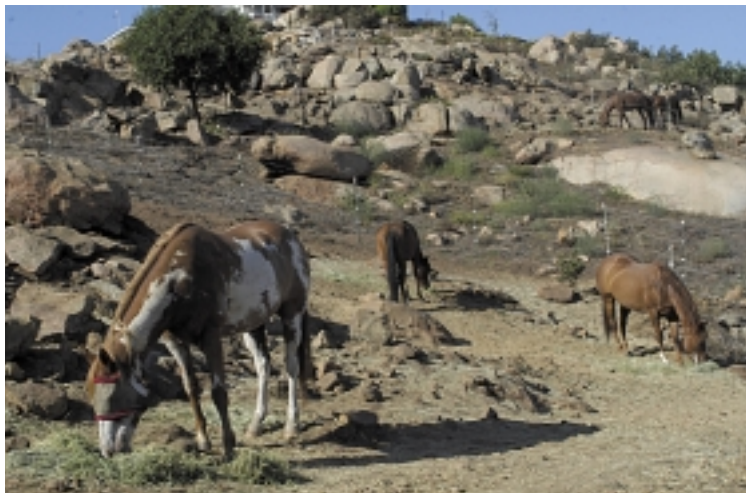
"Our 1 1/2 acre natural pasture was created inside a perimeter chain link fence, utilizing an inexpensive Premiere 1 electric fence system that creates a big circle around a smaller circle, in which hay is distributed morning and evening. They pretty much move around this large circle all day long."

We dug deeper, consuming books, articles, and DVDs until I thought my head was going to burst, cramming at light speed to make up for all the years of experience that we didn't have. To learn what makes these wonderful animals tick. There had to be better answers.