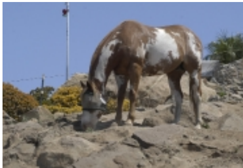
Scribbles, an 8 yo Paint gelding, at home in his rocky pasture. After de-shoing, his hooves took 7 months to regrow into a healthy, strong form.