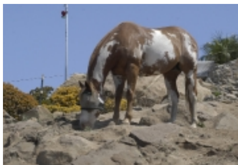
Scribbles, an 8 yo Paint gelding, at home in his rocky pasture. After de-shoing, his hooves took 7 months to regrow into a healthy, strong form.