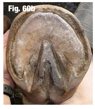
Day 42 - Left Front, after 21 Fig 61a, b: This days Oxine alternating with No Thrush, then 21 days of No Thrush only.

more frequently. After consulting authors, the Josephine decided to apply Oxine alone, along with the agent "No Thrush."