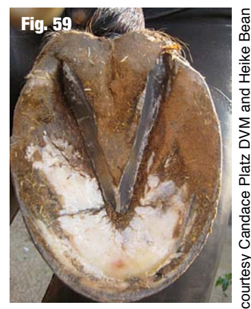
Fig. 59 shows clean, the waxy-looking live frog horn on the sides and the dead. fuzzy looking layer covering the rest of the frog. Note also the fuzzy looking depths of the collateral grooves. These grooves

should be judiciously cleaned so that the "fuzz" is removed, exposing any discoloration or infection.