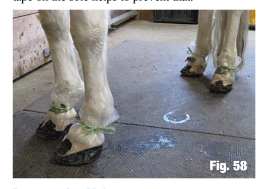
Fig. 58 shows all 4 feet in boots, and tied with bailing twine. Duct tape may also be used. On smooth surfaces, the horse can walk around safely in those boots. You even can turn him out in them, but they do wear on abrasive footing. Extra layers of duct tape on the sole helps to prevent that.