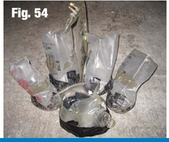
Fig. 54 demonstrates how 3000 ml IV bags make excellent reusable soaking boots for most horses. Using duct tape, we make boots out of them,

which allows for easy on and off. Mark the boots for each horse and hoof with permanent marker. For the smaller