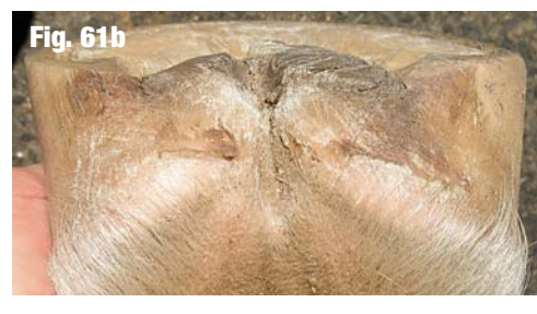
Day 47 - after 47 days of treatment with No Thrush only.

Healing diseased frogs can be very challenging and often frustrating. The lifestyle of many domestic horses promotes chronic re-exposure to pathogens. The equine body was not designed for this level of infectious challenge, and is further compromised by improper nutrition and inadequate exercise needed for optimal immune function.